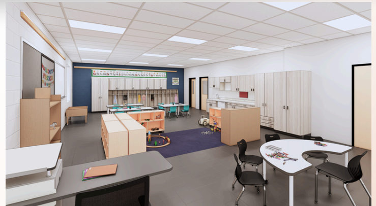
Pre-K Classroom Rendering